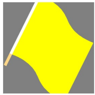
Caution Flag - Signals that the track is not safe to proceed at racing speeds.

Shown to lapped traffic, vehicle shall hold its line allowing faster cars to pass safely.