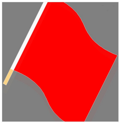
Red Flag - Signals that the track is not safe to proceed at any speed.

No racing to the yellow flag & No passing allowed. Hold your position. Yellow Flag laps will not count. ( Unless specified for special events ) The re-start line-up will be determined from the last <u>scored</u> green flag lap.